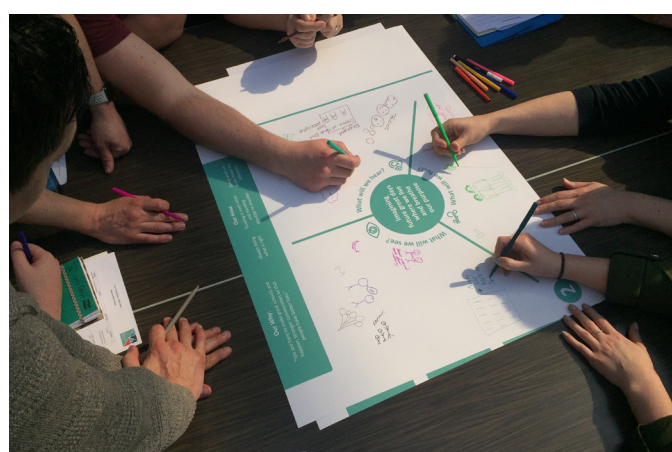
Working together and sharing ideas