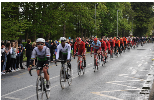
Cyclists passing both schools

Last week, two of our trust schools were lucky enough to have the race fly past their school gates. The Snaith School took all 900 students and staff out to cheer on the cyclists. Four hundred and fifty South Hunsley students lined East Dale Road and both schools were featured by the BBC in their footage. Hunsley Primary School were also part of the celebrations and made yellow and blue flags which were then displayed around the local area.