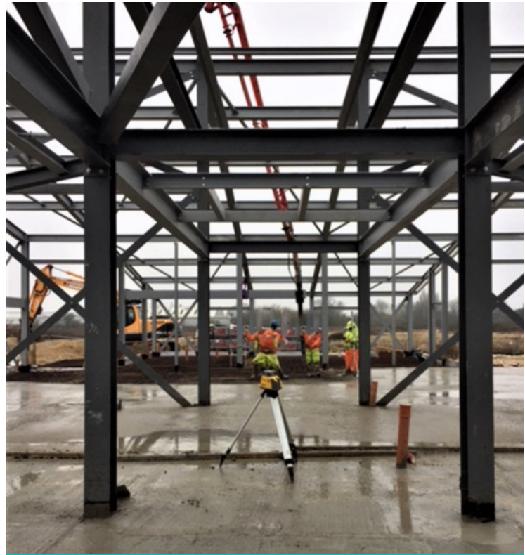
Hunsley Primary Site Development