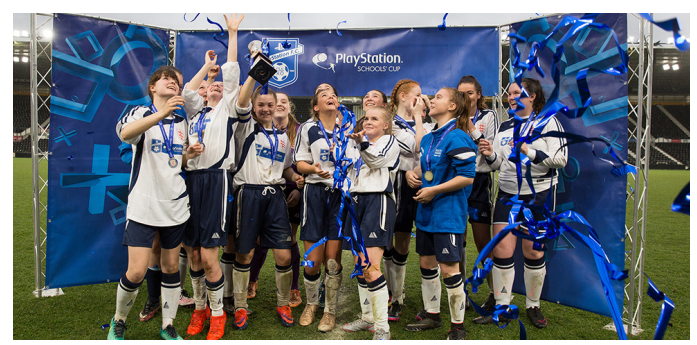
South Hunsley School - U15 PlayStation Schools' Cup National Champions

The Year 8 netball team represented the East Riding at the Humber School Games Netball competition. Having played each team twice, South Hunsley were unbeaten during the tournament and crowned the winners for the second year in row.